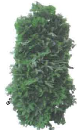
Grave Blanket Multiple Sizes Decorated with pinecones and bow