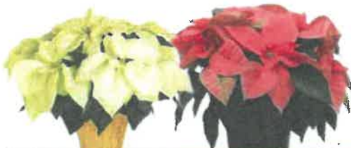
Poinsettias Multiple sizes available White, Pink, Marble, Red