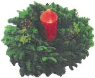
Candle Ring Candle Not Included

Cedar Garland and bow options not pictured