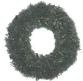
Fancy Balsam Wreath with Bow Multiple sizes and multiple bow options