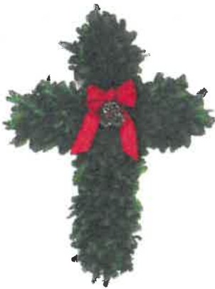
Cross with Bow multiple bow options