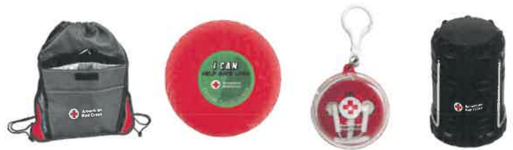
Gift awarded for each student recruiter. Items may vary based on availability.